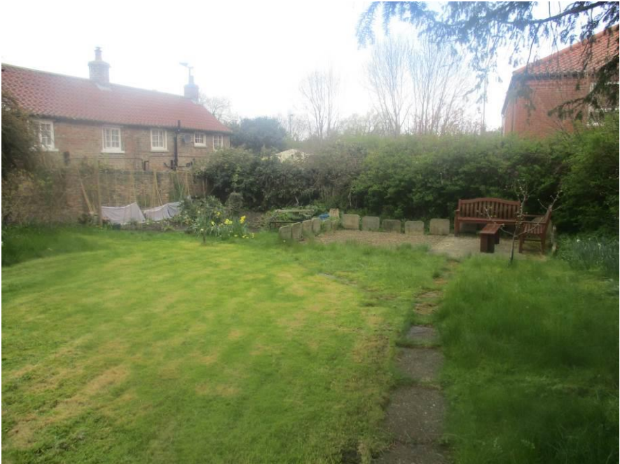
Figure 3: Burial ground

Royal Botanical Gardens in Kew as a Keeper of the Herbarium. Baker became a Fellow of the Royal Society and the Linnaean Society.