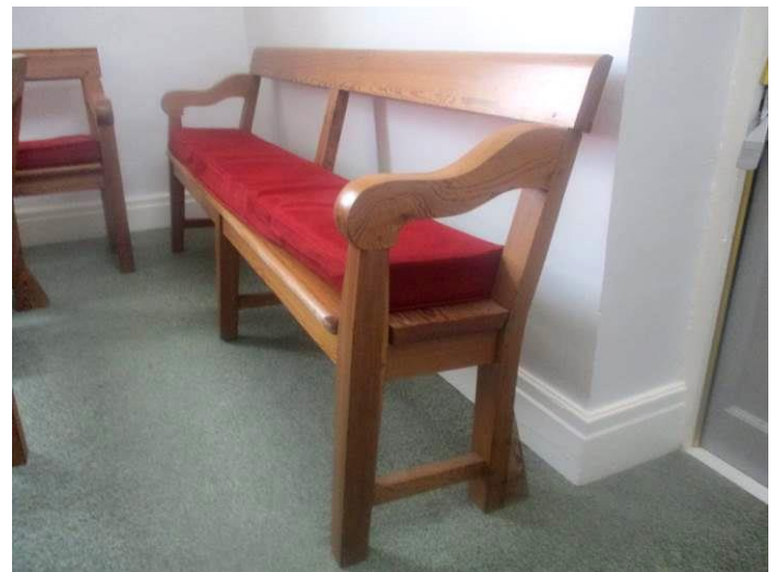
Figure 2: One of the open-backed benches in the meeting house

The meeting house contains a set of benches with open backs and shaped arms, which date from the nineteenth century.